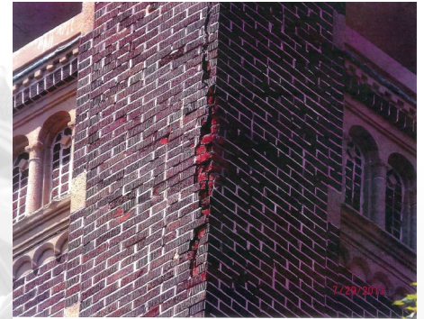
Corner of Bell Tower

The masonry walls, constructed using composite materials, have deteriorated over time due to the use of improper mortar. Our restoration plan includes repairing the damage and returning the mortar to its original, darker color, preserving the building's historic character.